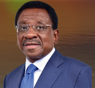
H.E. SC. James Orengo Governor, Siaya County