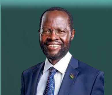
H.E. Prof. Peter Anyang' Nyong'o Chair-Lake Region Economic Bloc & Governor, Kisumu County