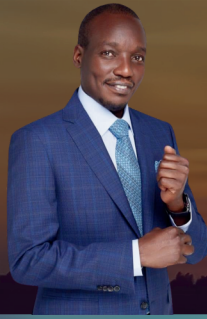
H.E. Simba Arati Governor, Kisii County