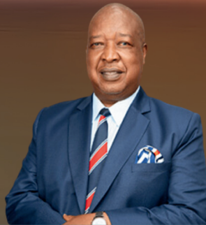
H.E. Amos Nyaribo Governor, Nyamira County