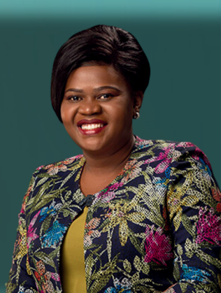
H.E. Gladys Wanga Governor, Homabay County